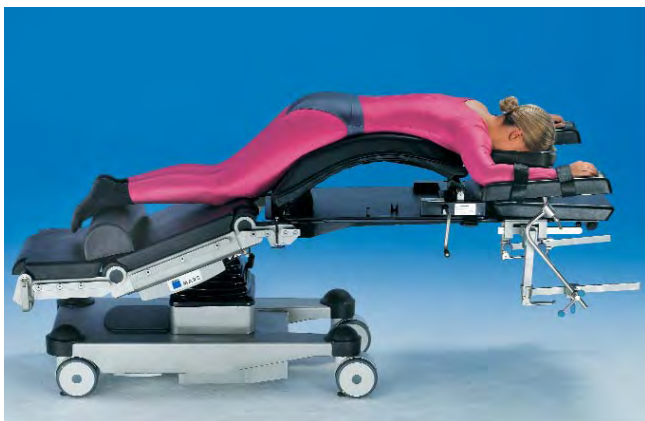
MARS low version – for spinal surgery, for example