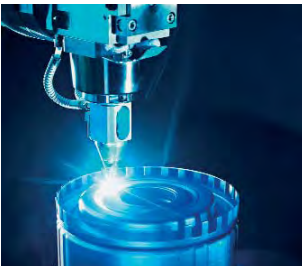
TRUMPF laser technology