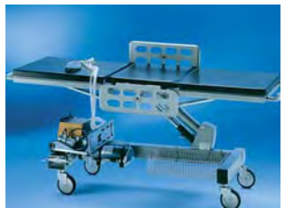
CALYPSO – radioscopic casting table and emergency transporter