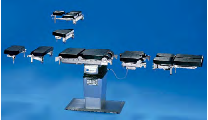
TRUMPF operating tables can be individually configured