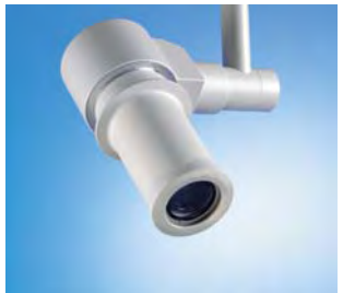
Camera on separate bracket

The first sterile surgical light camera for use in operating rooms. With SDI output and digital image capture, it enables live transmission from the OR in digital video quality and fast, direct archiving of still images.