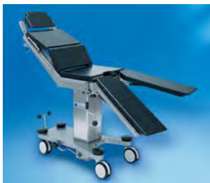
MERKUR – easy handling

The ideal partner when radiological examination or lithotripsy intervention is necessary, be it before, during or directly after the operation.