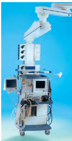
Motor-adjustable height with 180 kg payload

TRUMPF KREUZER ceiling pendants come in three weight categories and enable tailor-made solution systems for anaesthesia, minimally-invasive surgery, endoscopy, intensive care, neo-natal care and emergency medicine.