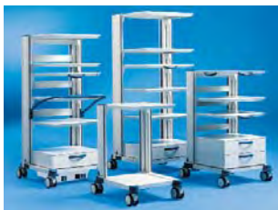
kombiTROLL® equipment trolleys