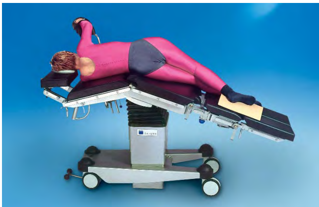
SATURN Select – renal position