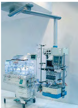
uniPORT in neo-natal care

Ergonomic and future-oriented for intensive use in clinics and practice.