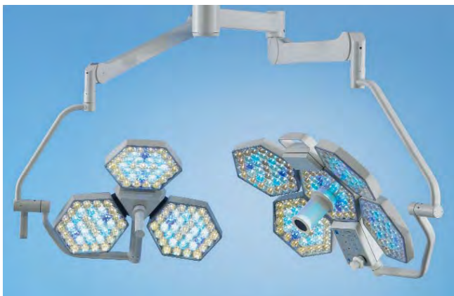
iLED 5 camera / iLED 3