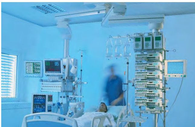
Intensive care – Freely-accessible head element facilitates emergency care