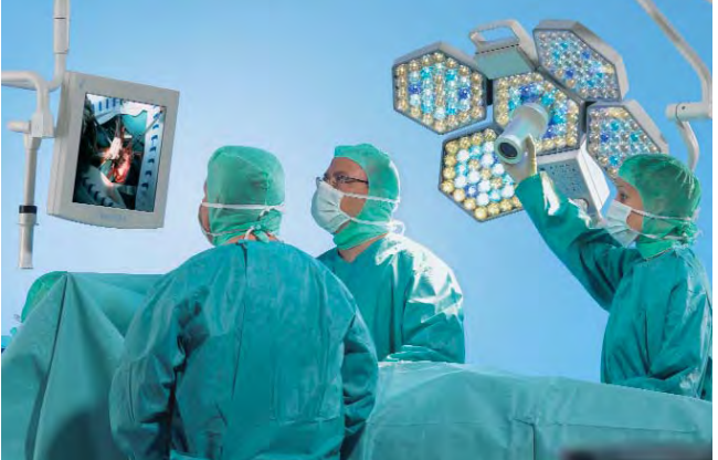
Digital image transfer and archiving during operation

The first sterile surgical light camera for use in operating rooms. With SDI output and digital image capture, it enables live transmission from the OR in digital video quality and fast, direct archiving of still images.