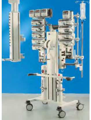
IMEC – safe and efficient transport for patients and personnel

Optimising processes is often the best way of leveraging cost-saving potential in hospitals. TRUMPF patient transport systems are a product family for intra-clinic patient transfer and facilitate intra-operative diagnostics. They optimise handling processes, make the work of hospital personnel easier and enhance patient safety.