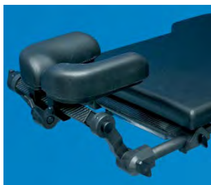
Carbon-fibre head positioning system

Intra-operative diagnostics are a key element of successful and cost-effective operating. Modular carbon-fibre operating tables and elements from TRUMPF are designed for all kinds of operations and enable hassle-free imaging at exactly the point the surgeon requires.