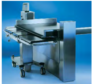
ORBITER – hassle-free, energy-saving patient transfer