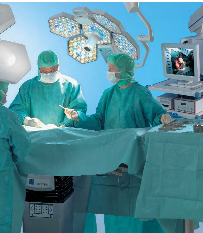
JUPITER – the exchangeable section system

Flexible and time-saving process flow in the operating room