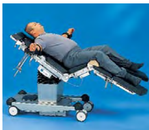
TITAN – up to 450 kg patient weight

Flexible, mobile and strong – all at a reasonable price. Easy to move, thanks to motorised drive support and brake support systems. Special extra-low version for operating from a seated position.