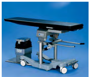
Shuttle can be docked on either side

The modular JUPITER exchangeable section system fulfils all the requirements of modern diagnostic and operative medicine. Its equipment, functionality and extensibility make it the superior operating room table.