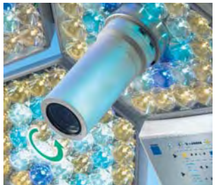
Integrated video camera with motorised image set-up