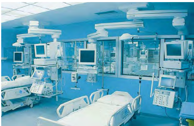
Intensive care / recovery area