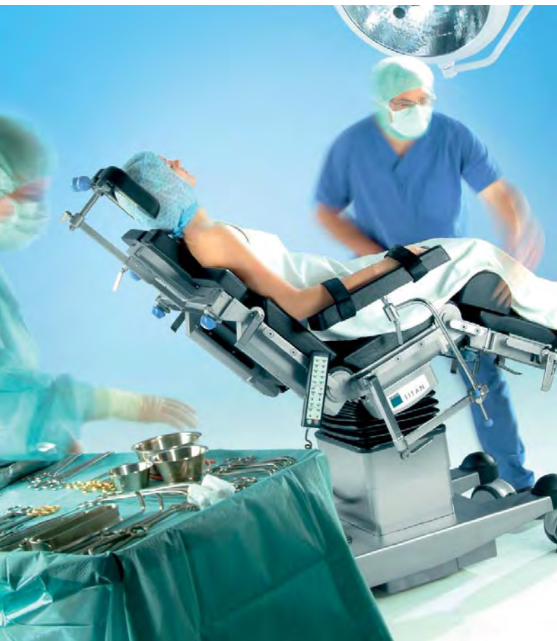
TITAN – the heavy-load table with drive

Speedy, precise positioning before and during operations